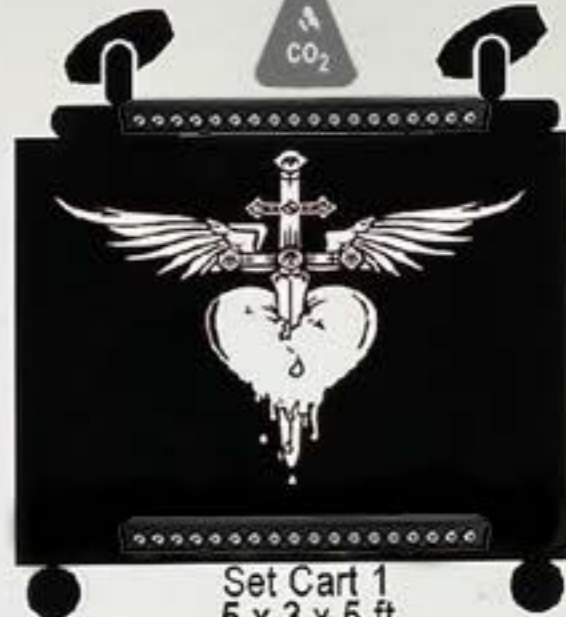
Set Cart 1 5 x 3 x 5 ft