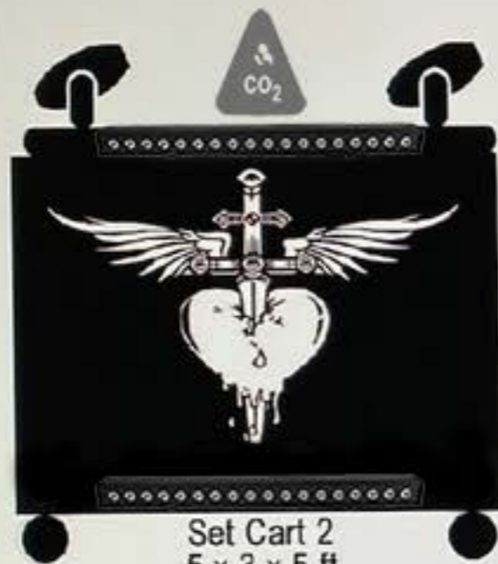
Set Cart 2 5 x 3 x 5 ft